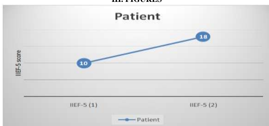
Fig 1. The results of International Index of Erectile function 5 (IIEF-5)